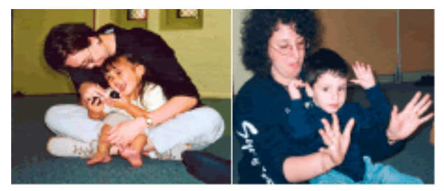
Your child's most important Kindermusik Educator: You

cultivates your child's heightened attentiveness to sound discrimination